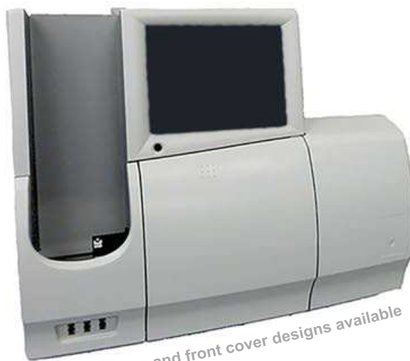
Different colors and front cover designs available